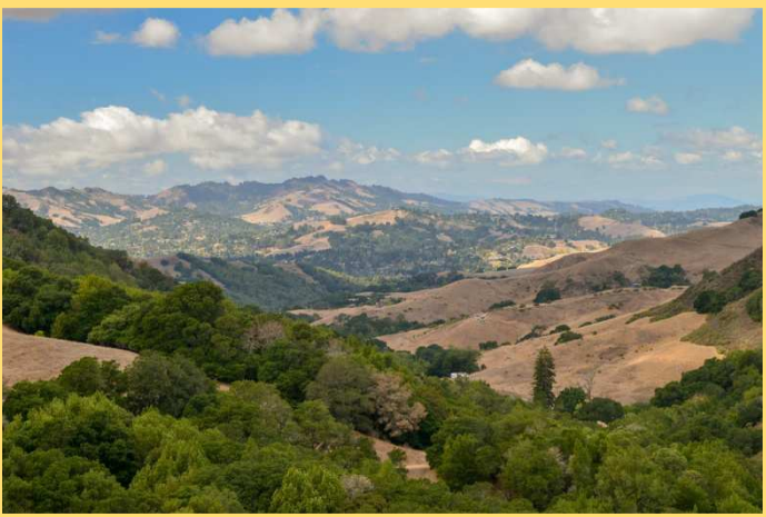
Las Trampas Regional Wilderness