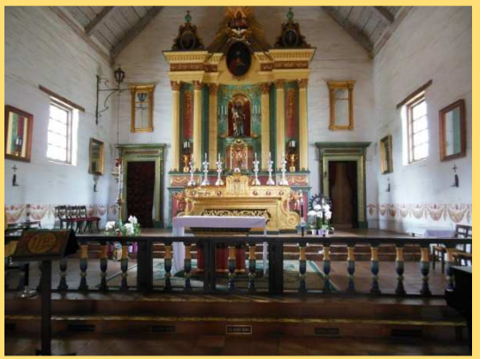
Mission San Jose, Fremont CA