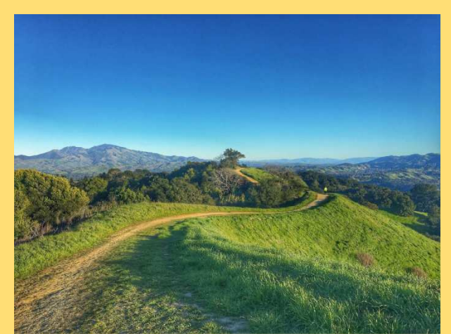
Briones Regional Park