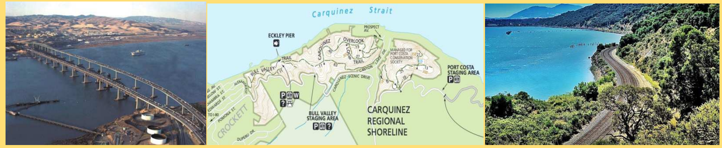
Benicia-Martinez Bridge (I-680) and Carquinez Strait Regional Shoreline